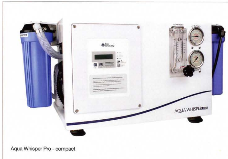
Aqua Whisper Pro - compact

The Aqua Whisper Pro watermaker is suited for charter, offshore fishing, and ocean cruising. Its traditional manual functions and touch-pad control panel allows simple operation and digital + analog instrumentation for redundancy. The Aqua Whisper Pro's high pressure pump is engineered to be quieter than conventional high pressure pumps, and operates for 2,500 hours before any maintenance is required.