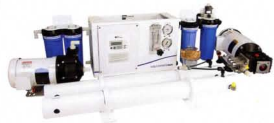
Aqua Whisper Pro - modular