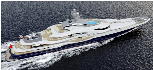
100m motoryacht Atessa IV , with a four-fin Naiad stabilizer system and DATUM AtRest controls.

Effective roll damping of a vessel not making headway, such as when at anchor or adrift, has been a persistent motion control problem. As marinas become increasingly crowded and slips more difficult to obtain, passengers and crew are more frequently aboard under anchored or moored conditions. Harbors, being busy and relatively shallow, often generate wave conditions that cause significant rolling, especially when the wave period nearly matches the vessel's natural period. Uncomfortable