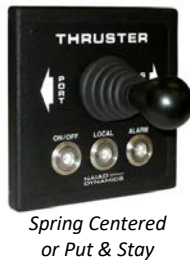
Spring Centered or Put & Stay

Single-stage or fully variable (proportional) controls. Proportional configuration permits the output of the thruster to be throttled by the operator and features a PLC (Programmable Logic Controller) specifically programmed for the application. Controls are housed in a single, durable enclosure for ease of installation. Easily fitted with numerous joystick controls. Most NAIAD thrusters are powered by a Naiad Integrated Hydraulic System (IHS). The PLC is easily configured to control many ancillary hydraulic shipboard systems.