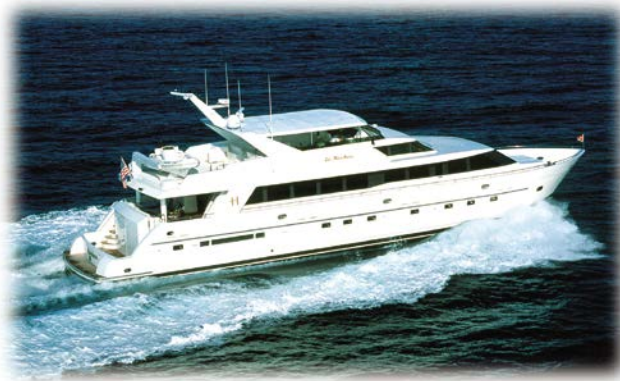
Hargrave Custom Yachts 100' La Marchesa equipped with the NAIAD ® MultiSea II Stabilizer Control System and IHS.