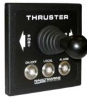
Spring Centered or Put & Stay

Single-stage or fully variable (proportional) controls. Proportional configuration permits the output of the thruster to be throttled by the operator and features a PLC (Programmable Logic Controller) specifically programmed for the application. Controls are housed in a single, durable enclosure for ease of installation. Easily fitted with numerous joystick controls. Most Naiad thrusters are powered by a Naiad Integrated Hydraulic System (IHS). The PLC is easily configured to control many