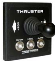
Spring Centered or Put & Stay

Single-stage or fully variable (proportional) controls. Proportional configuration permits the output of the thruster to be throttled by the operator and features a PLC (Programmable Logic Controller) specifically programmed for the application. Controls are housed in a single, durable enclosure for ease of installation. Easily fitted with numerous joystick controls. Most Naiad thrusters are powered by a Naiad Integrated Hydraulic System (IHS). The PLC is easily configured to control many